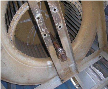
Fan and bearing casing

Our refrigeration apprentice was working on a roof attempting to pull bearings off a steel shaft. He was tapping the bearings with a hammer and some steel came off striking him in the eye, the steel lodged in his eye and protruded out requiring surgery to remove the steel and close the wound on the eye ball.